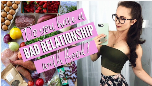
Good Vs Bad Relationship with Food