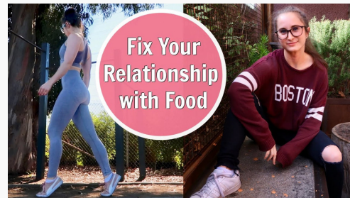
How to Fix your Relationship with Food